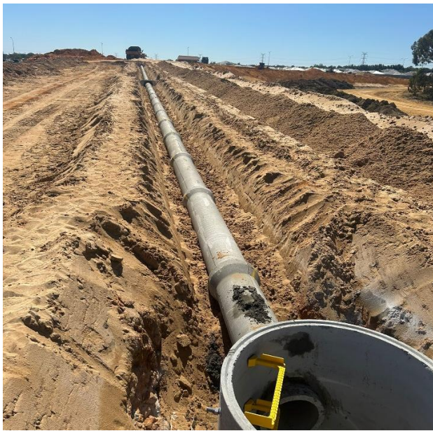
Image: Drainage works northeast of Drumpellier Drive / Reid Highway.

Drainage works will also continue in the area, including construction of culvert headwalls.