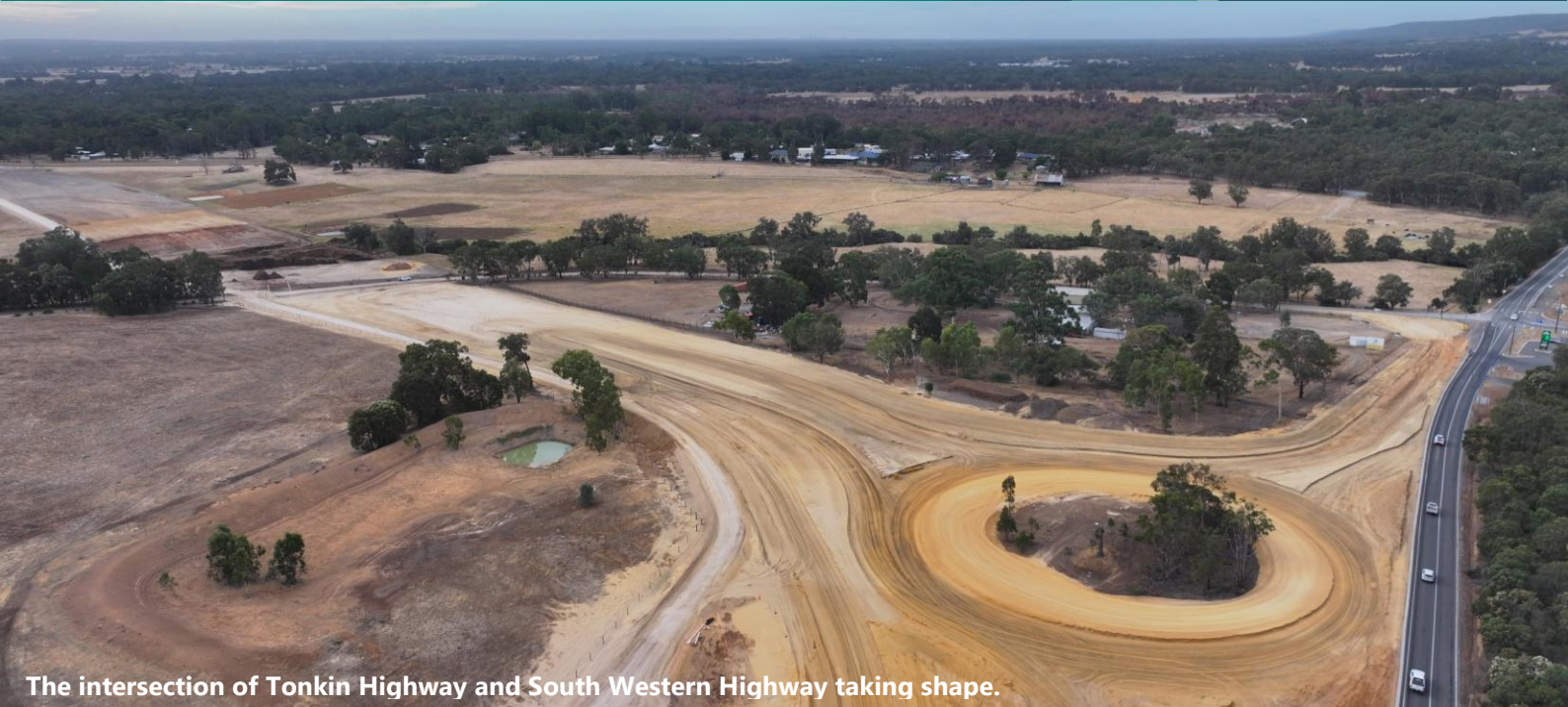
The intersection of Tonkin Highway and South Western Highway taking shape.