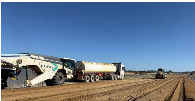
Material stabilisation is underway.

Since February 2026, out of hours haulage has enabled the delivery of more than one million cubic metres of fill across the project. Completing this work ahead of winter will help minimise weather related disruptions and allow construction to continue more efficiently during the winter months.