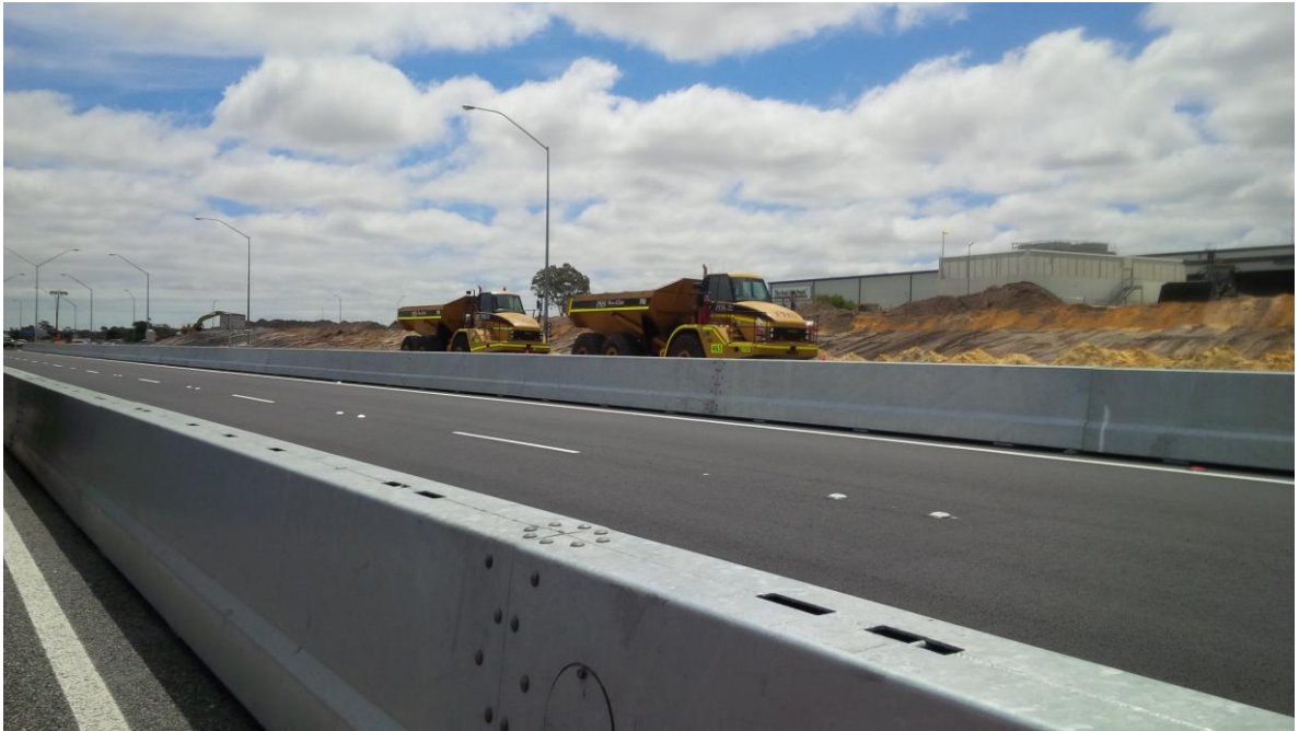
Photograph of Installation