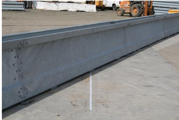
Photograph (showing T-Top section)