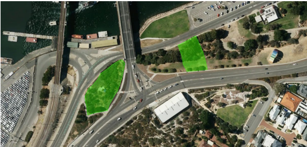
Approximate vegetation clearing locations