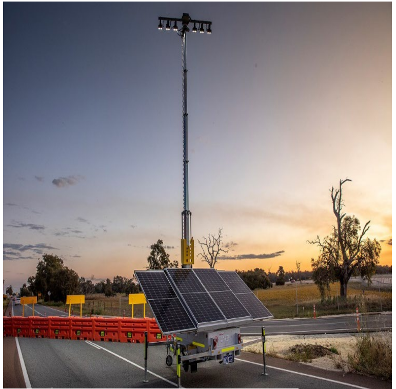
Example of solar power lighting tower

Temporary solar power towers will provide lighting for road users. These sustainable lighting towers will remove the need for diesel generators, reducing noise and odour for residents in the area.