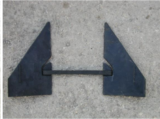
Photographs of joint wedges