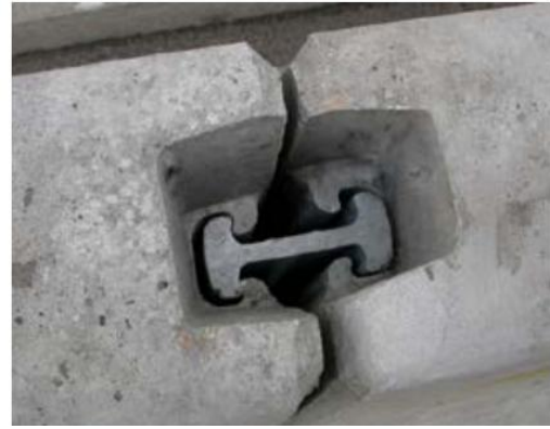
Section and Joint Photographs