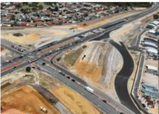
Image: Roundabout construction at Drumpellier/Daviot intersection.

Once the roundabout is operational, the existing traffic signals will be permanently removed. We encourage you to plan ahead to allow for additional travel time as some travel delays are anticipated once the roundabout is operational, particularly during peak periods.