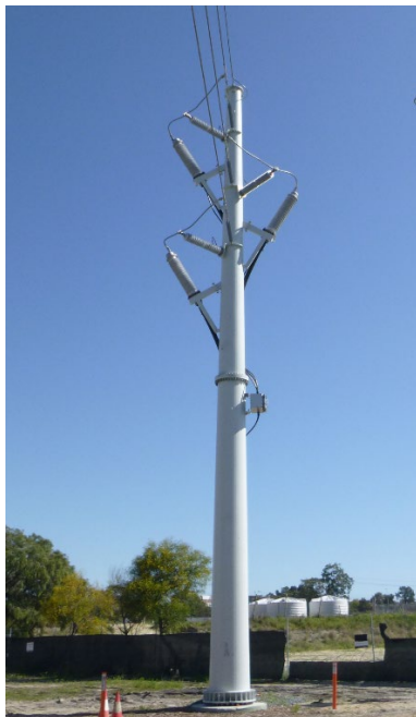
Fig 3: Steel transition pole