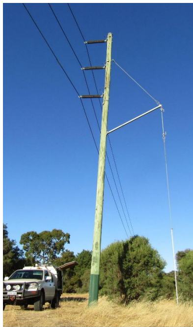
Fig 2: Wooden power pole

Images of the proposed wooden poles and the steel transition poles are included below for reference. The height of the wooden poles will be consistent with the existing poles in the area. The steel poles will be 21 metres high, with a foundation diameter of 2 metres.