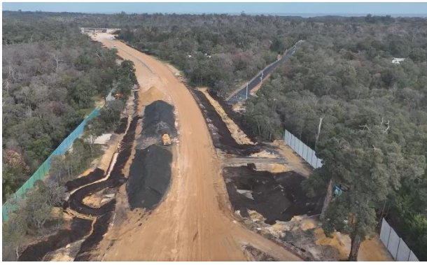
Noise walls and main alignment works, Gelorup