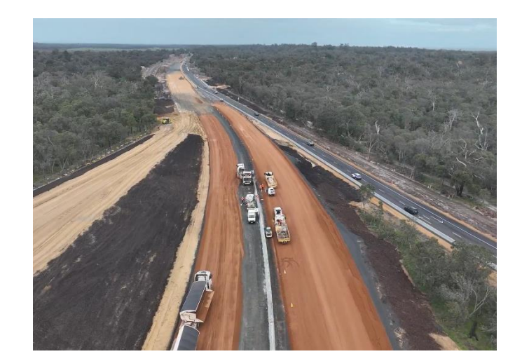
BORR and Bussell Highway Southbound