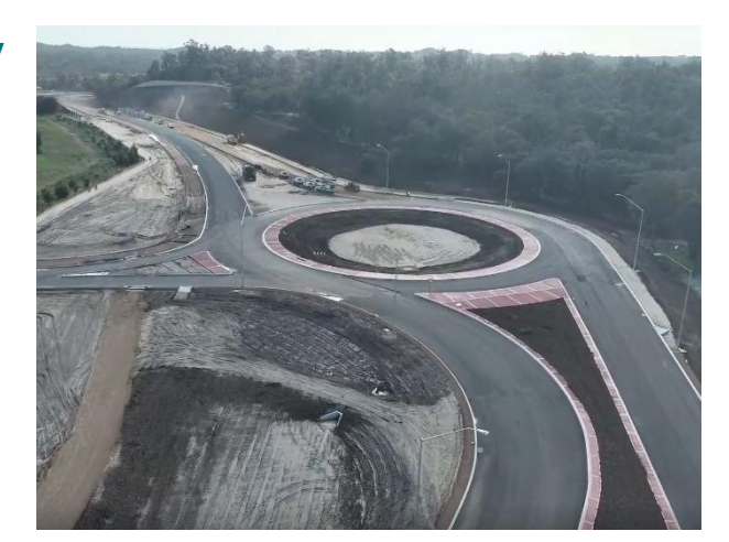
Lillydale Road and Jules Road Roundabout

• Utility and road drainage works, building concrete foundations and installing light poles at Bussell Highway and Lillydale Road.