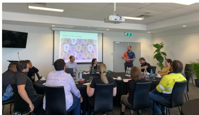
Aboriginal business seminar on contracts and commercial basics

To find out more about the seminar, click here to read the full story.