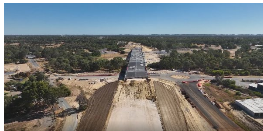
The Mega-Bridge deck

As the project continues towards completion, the BORR team maintain its commitment to engaging with the region's stakeholders and community to ensure detailed planning and traffic management is communicated.