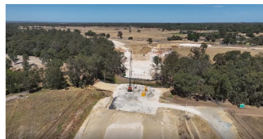
Piling at the Preston River