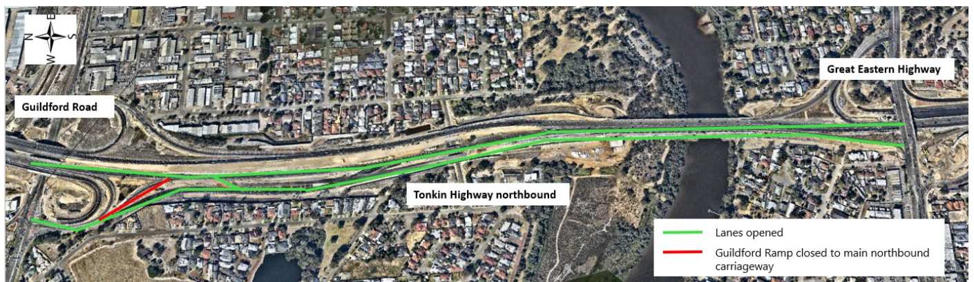
Map 1 Great Eastern Highway works

Pending approval, you will see temporary traffic changes between Great Eastern Highway and Guildford Road from 16 May to mid-June. Traffic entering Tonkin Highway northbound from Great Eastern Highway will be driving on a new section of the Redcliffe Bridge. Once this switch happens, commuters travelling on Tonkin Highway northbound main carriageway will not be able to exit at Guildford Road (map 1). A detour will be in place for northbound traffic who want to exit at Guildford Road. If you are traveling from Great Eastern Highway heading north, access to Guildford Road remains. This is so the team can complete pavement works adjacent to the ramp. Stay up to date on Main Roads website and our Tonkin Gap Facebook page for further information