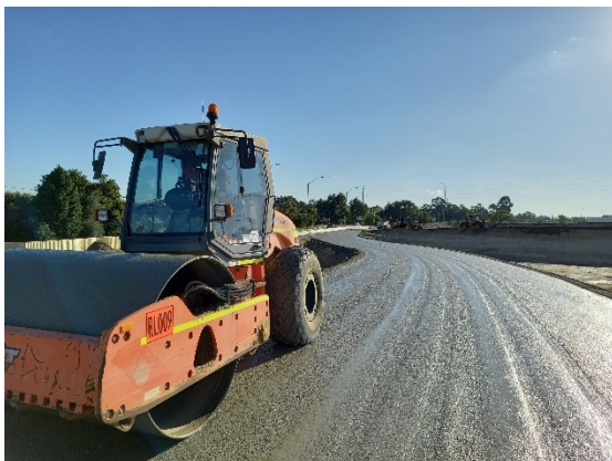
Temporary Guildford Road ramp