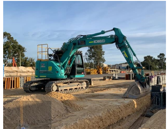
Works for Southern Dive structure

FB: https://www.facebook.com/groups/morley.ellenbrook