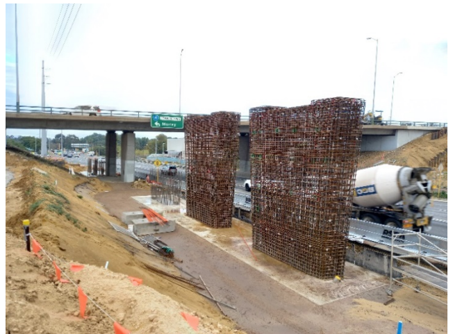
Guildford Road bridge piers

From late-July, we will shift traffic slightly south on Guildford Road to allow for construction of the Guildford Road bridge piers. To do this, we will be working at night to install temporary traffic barriers. Lane closures will be in place during night works.