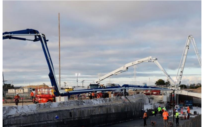
Early morning concrete pour at the northern dive

In January our crews will be working out of hours (7pm until 7am) in our project area and along Tonkin Highway between Dunreath Drive and Hepburn Avenue. Dates are subject to change and specific details will be communicated on the Facebook page and Main Roads WA website.