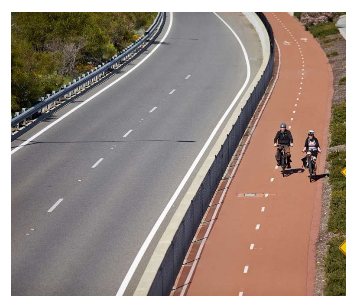
An example of a Principal Shared Path designed to current standards

During construction, detours and traffic management will be in place to safely guide people who will be using the paths throughout the area.