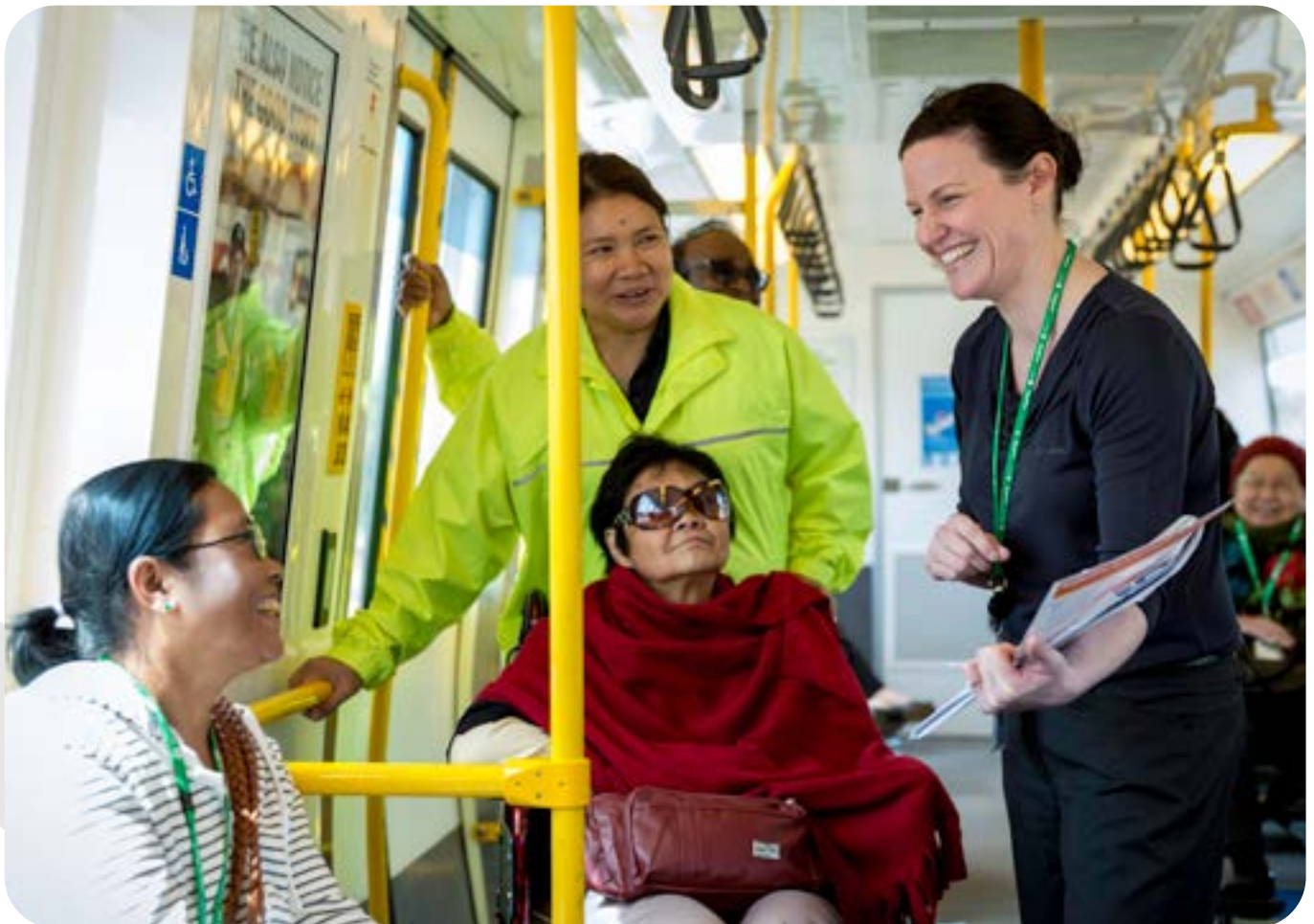
Image: Transperth Education team providing a network tour on a Transperth Train

We also received positive feedback in several areas including customer service, Transperth Assist app, talk back radio, access and inclusion reference groups, consultation for Main Roads projects and programs delivered by the Transperth education team.