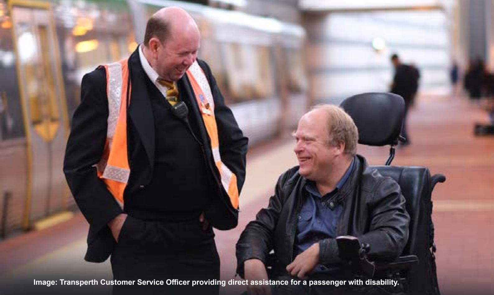
Image: Transperth Customer Service Officer providing direct assistance for a passenger with disability.